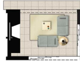
Optional Fireplace/TV on Lanai

5 BEDROOMS, 5 BATHS AND 2 HALF-BATHS, 3-CAR GARAGE, OPTIONAL THEATER LIVING AREA: 3,940 SQUARE FEET TOTAL AREA: 5,096 SQUARE FEET