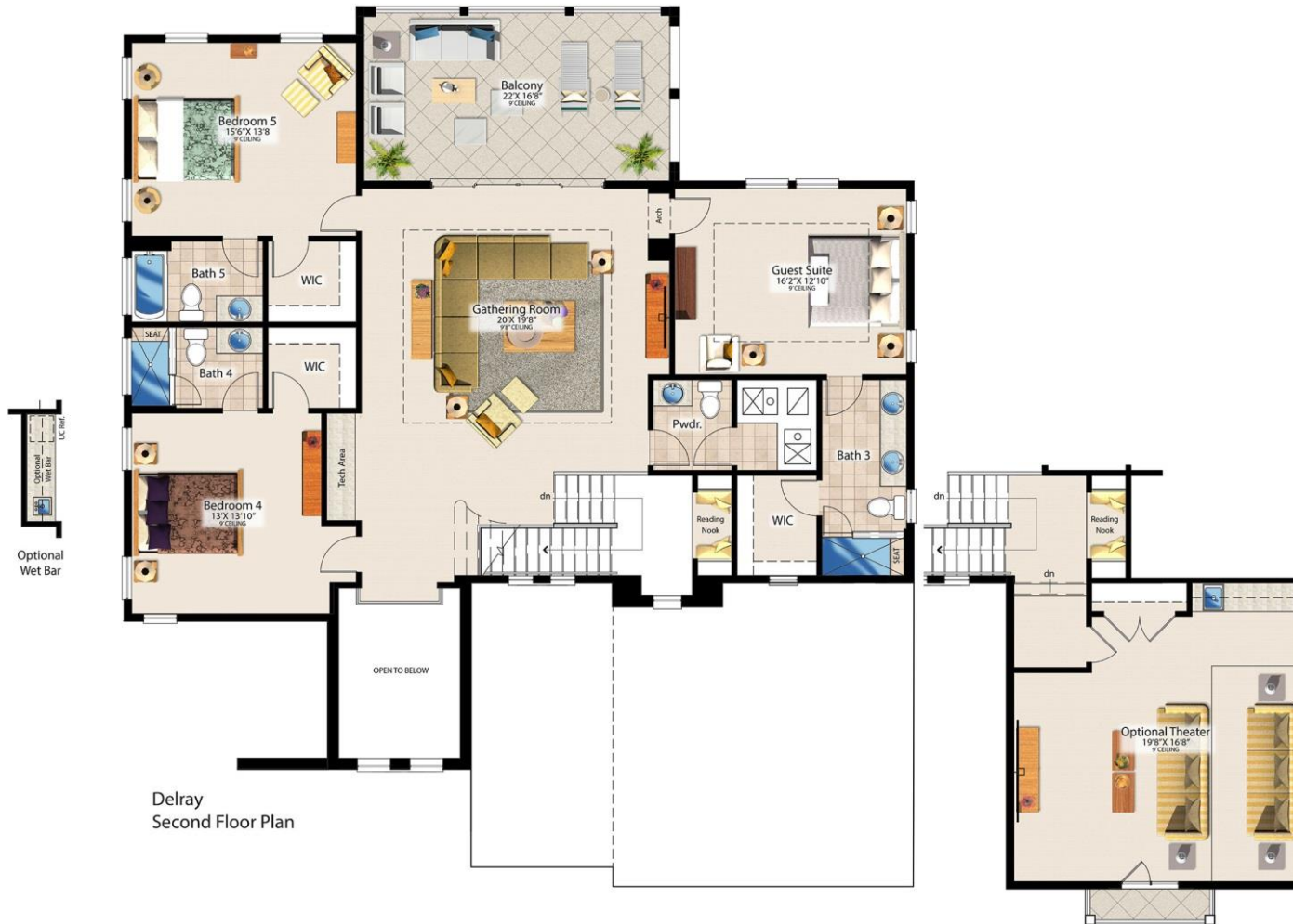
Delray Second Floor Plan