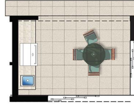
Optional Summer Kitchen on Lanai