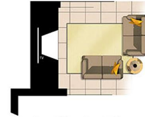
Optional Fireplace/TV on Lanai