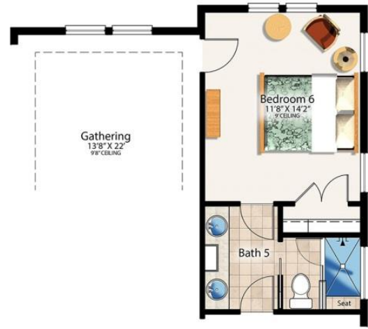
Optional Bedroom 6 & Bath 5