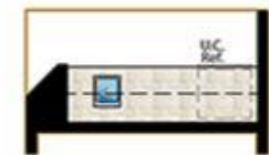
OPTIONAL WET BAR (IN LIEU OF TECH AREA)