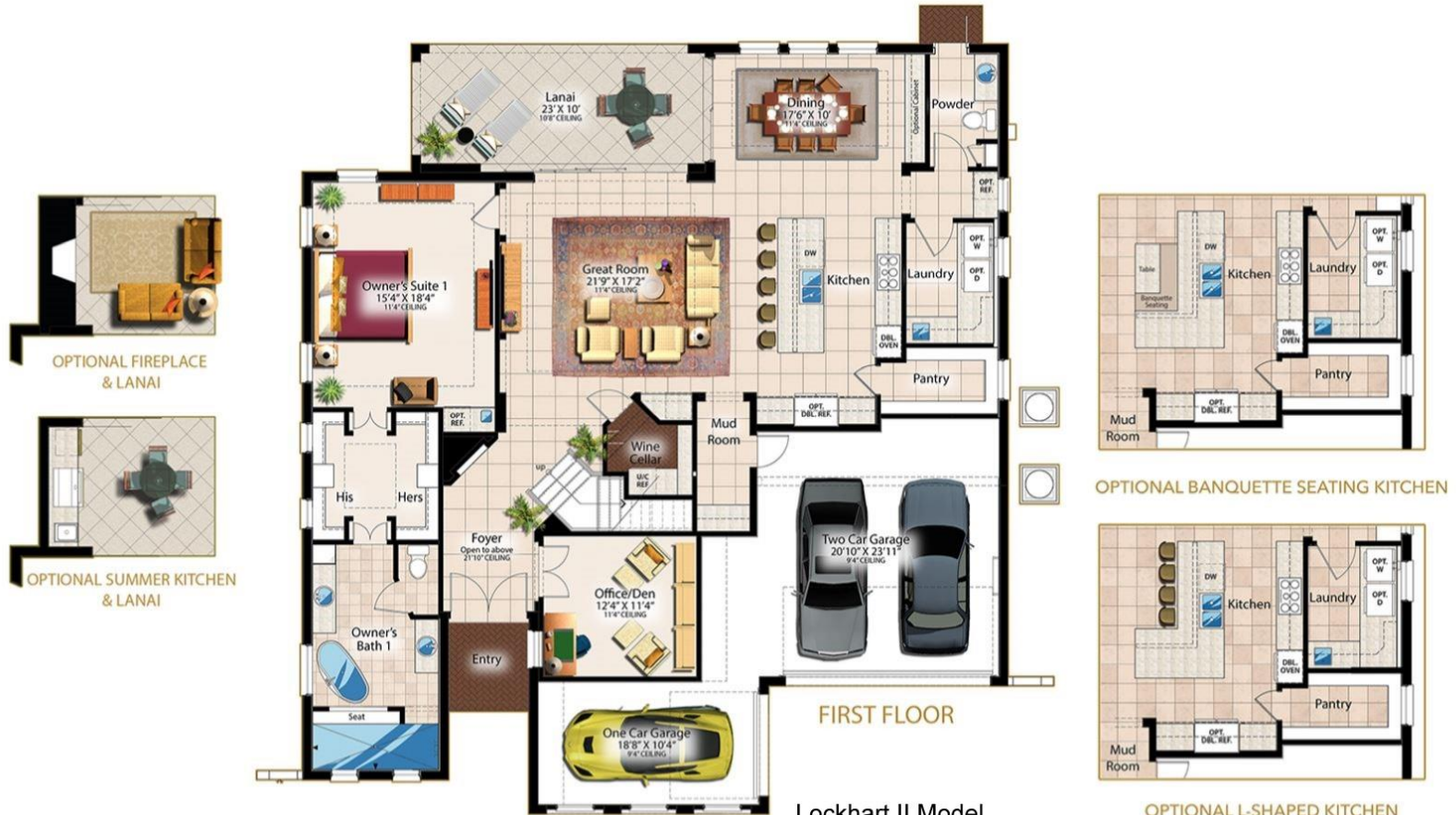
Lockhart II Model 5 Bedroom, 4 Bath, 1 Half Bath 3 Car Garage

5 BEDROOMS, 4.5 BATHS, THEATER, BONUS ROOM, 3-CAR GARAGE LIVING AREA: 4,671 SQUARE FEET TOTAL AREA: 5,847 SQUARE FEET