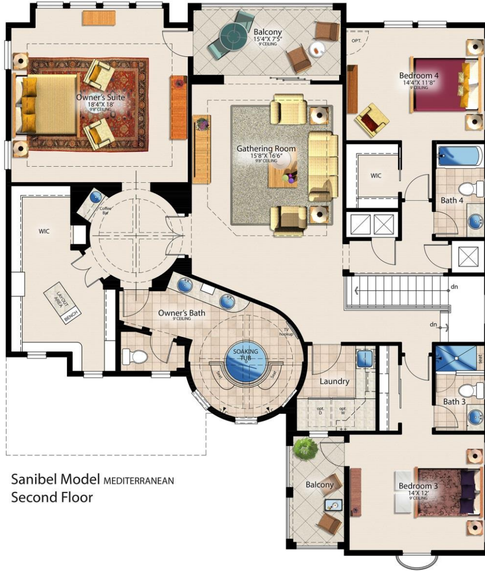
Sanibel Model MEDITERRANEAN Second Floor