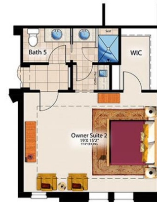
Optional Owner Suite 2