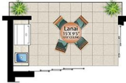
Optional Summer Kitchen on Lanai